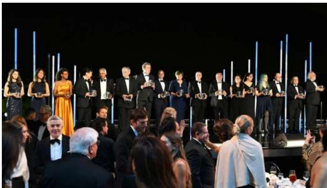
April 17, 2023, 9 th Breakthrough Prize Ceremony, Hollywood, L.A. CA Awardees are recognized onstage.

Each prize is $3 million and presented in the fields of Life Sciences, Fundamental Physics and Mathematics. In addition, the New Horizons in Physics and Mathematics Prizes and the Maryam Mirzakhani New Frontiers Prize are awarded to early-career researchers.