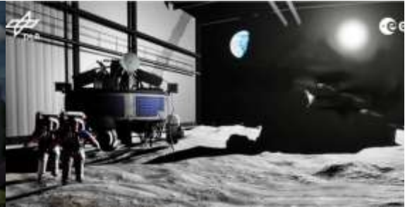
Possible integrated training scenario

Much like the international Space Station ISS, future exploration of Moon and Mars is an international endeavor that will be realized in cooperation of many partners. Germany and ESA are jointly contributing strategically with the various institutes and faculties of DLR, the European Astronaut Centre (EAC) in Cologne and the German Space Operations Center (GSOC) in Oberpfaffenhofen, inclusive the secure ground communications network.