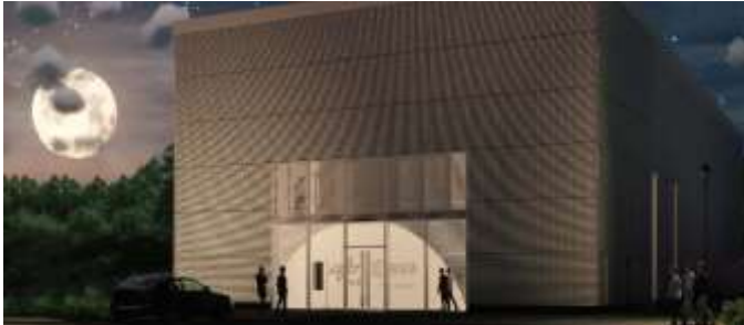
The LUNA analog training facility at DLR, Cologne

Integration of all systems enables a comprehensive, versatile utilization and scientific research from the beginning and extending well beyond the initial years.