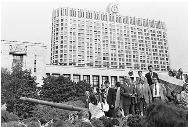
Yeltsin stands on a tank to defy the August coup in 1991.

https://commons.wikimedia.org/wiki/File:Boris_Yeltsin_in_19_August_1991-1.jpg