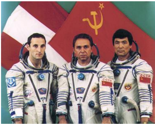
Crew of Soyuz flight TM-13: Franz Viehboeck, Alexander Volkov and Toktar Aubkirov (from left)

multitude of medical-biological and material-science experiments. The appropriate equipment was transported to Mir earlier with Progress M-9 (20 Aug. 1991).