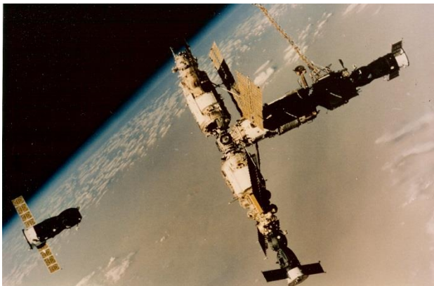
A view of the Russian space station Mir on 3 July 1993 as seen from the approaching Soyuz TM-17, carrying the new crew. The image is unusual in that it shows ongoing docking operations; Progress M-17 can be seen docked to the Kvant-1 module and Soyuz TM-16 (crew rescue vehicle) to the Kristall module, with Progress M-18 (left, detached) in the process of vacating the core module's forward port to allow Soyuz TM-17 crew (not seen in the picture) to dock there.

During Krikalev’s second, unexpectedly prolonged stay on Mir as station commander were periods of very high and critical activities punctuated by the “coming and going” participation of national and international cosmonauts/astronauts, interlaced with his worries about his uncertain future and safe return to his family. The flight turned out to be an unplanned “endurance flight requiring all his discipline, skills, patience and mental stability to fulfill all the required tasks. The following is an extract from the “Ezyklopädie Raumfahrt” [2] and shall illustrate the tenacity, professionalism and dedication of Sergei Krikalev demanding the admiration and respect of every “space –operations” insider.