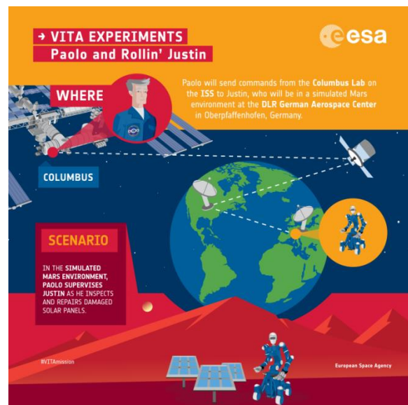
SUPVIS Justin communications set-up [4]

The experiment was part of ESA’s METERON (Multipurpose end-to-end Robotic Operations Network) project, a project which aims to develop strategies to allow astronauts to control robots from orbit to carry out complex dexterous tasks with significant communication round-trip times as pioneered by the DLR Institute for Robotics in in 1990’s with the ROTEX experiment during the D-2 spacelab mission.