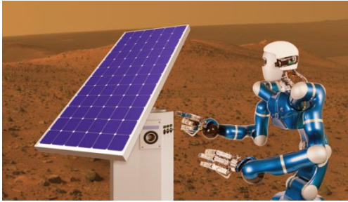
Justin approaching one of the solar panels for inspection at the simulator at DLR Oberpfaffenhofen. [1] Justin plugging in a diagnostic tool for checking and analyzing the simulated solar panel anomaly. [1]