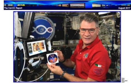
Paolo Nespoli on board the ISS during the experiment showing the SUPVIS experiment logo with the mobile control tablet PC in the background. [5]

With limited crew time available, the SUPVIS Justin teams, both in space and on the ground, had to become very efficient in running the experiment. With an additional 15 minutes crew time and with the help of two other astronauts (Jack Fischer, and Randy Bresnik) the team was able to successfully complete the last of the four scheduled protocols during the last minute of the time slot, and it looks like that all the hard work in the past several years to design and implement a nimble and robust robot-system really paid off. [3]