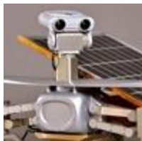
Part Time Scientists (Germany)

Team Indus was selected to compete for two of the Milestone Prizes, the Landing Prize, and the Imaging Prize. The team is managed by Axiom Research Labs Private Limited, an aerospace startup company, and is headquartered in India's IT industry hub, Bangalore. Through its lunar mission, Team Indus aims to showcase the creativity and capability of Indian entrepreneurs, promote higher scientific education, develop new homegrown space technologies and inspire an entire generation of young people.