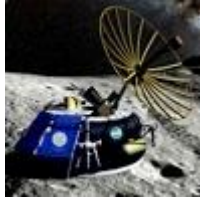
Moon Express (USA)

instrumentation and will use two wheels to move across the lunar surface. The micro-rover design highlights a particular strength in Japanese engineering – the miniaturization of complex machines.