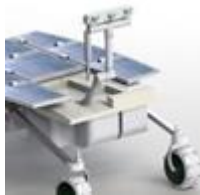
Team Indus (India)

Moon Express was selected to compete for three of the Milestone Prizes: the Landing Prize, the Mobility Prize, and the Imaging Prize. Moon Express is a privately funded company created to develop new commercial space activities and to open up the resources of the Moon for the benefit of humanity. Headquartered in Silicon Valley, Moon Express combines lean start-up principles with expertise in aerospace engineering and planetary sciences. Moon Express plans to send a series of low-cost robotic missions to the Moon, starting with its Google Lunar XPRIZE mission. The MX-1 is expected to launch in 2015 and land in the Moon's southern hemisphere.