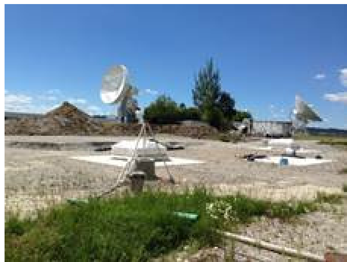
EDRS Ground Antennas Construction Site at DLR/Weilheim