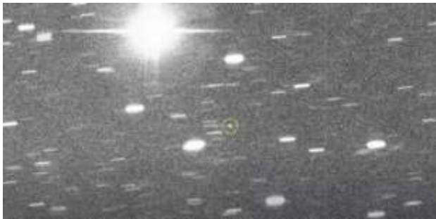
Oumuamua (yellow circle) in max. resolution [3]

solar system asteroids, but many valid models permit it to be more elongated than all but a few other natural bodies. While an unconsolidated object (rubble pile) would require it to be of a density similar to rocky asteroids, a small amount of internal strength similar to icy comets would allow a relatively low density. Oumuamua's light curve, assuming little systematic error, presents its motion as tumbling, rather than spinning, and moving sufficiently fast relative to the Sun that it is likely of an extrasolar origin. Extrapolated and without further deceleration, Oumuamua's path cannot be captured into a solar orbit, so it would eventually leave the solar system and continue into interstellar space. Oumuamua's planetary system of origin and the age of its excursion are unknown.” [2]