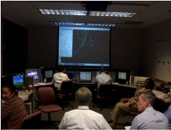
Figure 2: STS-121 Recovery Support at the Air Traffic Control System Command Center

that over-fly the NAS. Notices To Airmen listing the coordinates of the boundaries of these corridors are distributed to the NAS user community in advance of a landing to alert them of the potentially affected airspace.